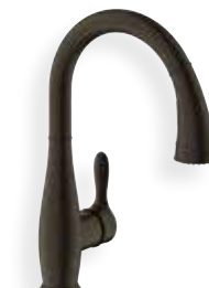
30 213 ZB0 Dual spray pull-down Oil Rubbed Bronze