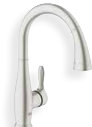
30 213 DCO Dual spray pull-down SuperSteel InFINITY™