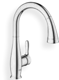
30 213 000 Dual spray pull-down GROHE StarLight® chrome